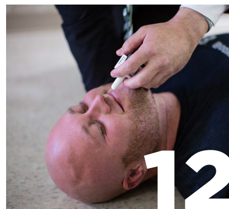
LEIC NARCAN Training

On the Cover: View of mountains after the wildfire See Article Page 7