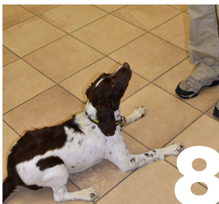
Rebel the Service Dog