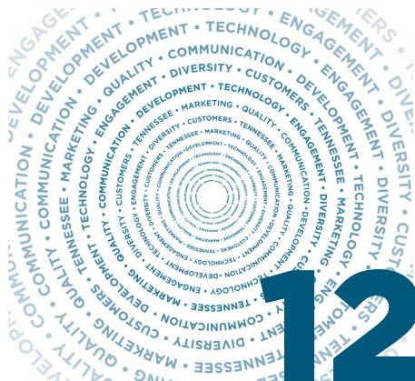
IPS Strategic Plan Launch

Association for Talent Development Training.....18