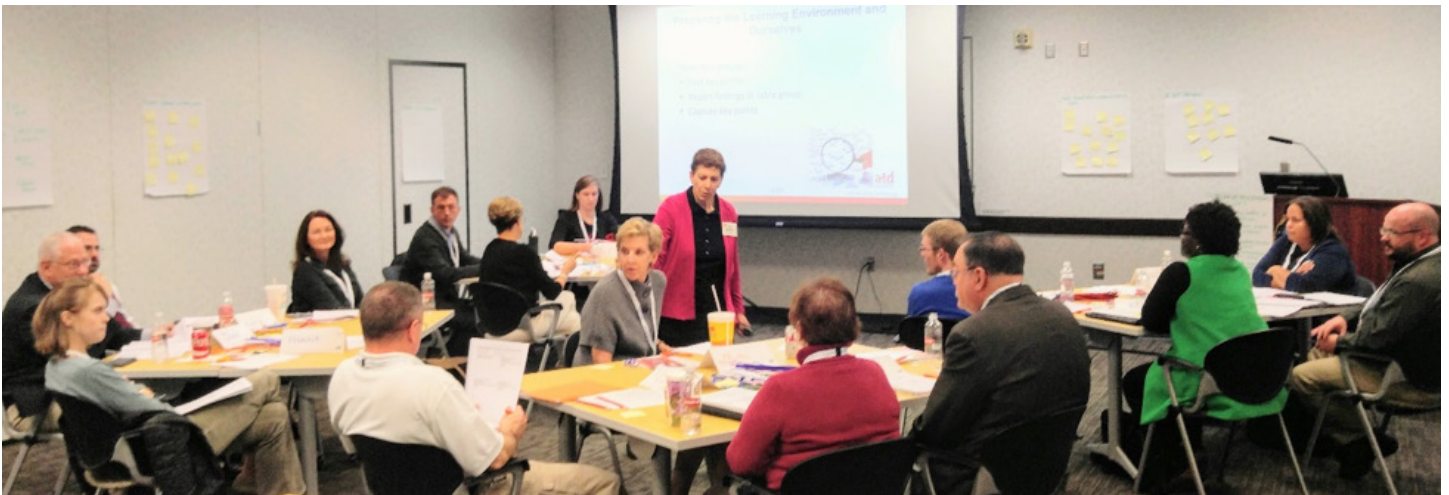
IPS employees attending training in Nashville and discussing best practices and how best to improve training for customers of the five agencies.

More than 70,000 professionals have enrolled in ATD Education programs. ATD's members come from more than 120 countries and work in organizations of all sizes and in all industry sectors.