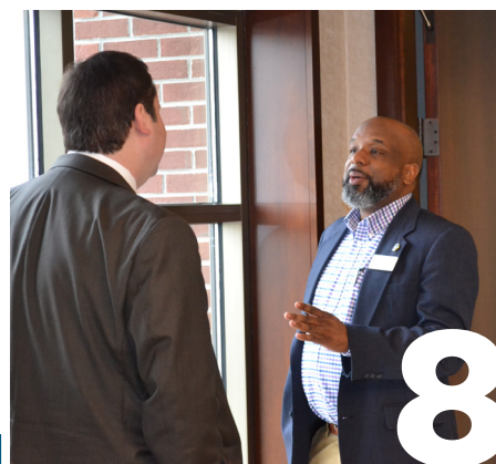
Newly Elected Legislators Workshop