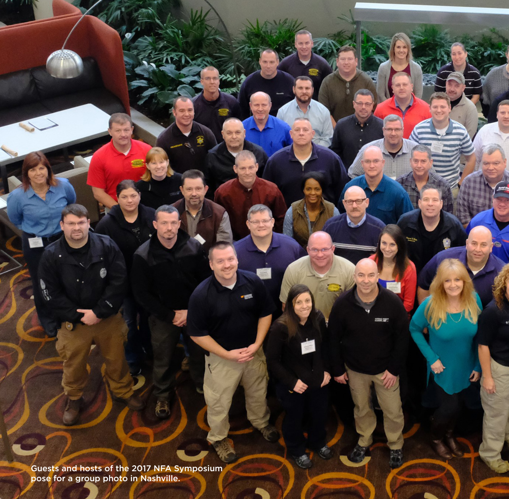
Guests and hosts of the 2017 NFA Symposium pose for a group photo in Nashville.