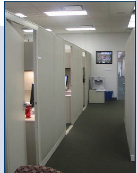
Upper left, MTAS library before; lower left, MTAS library after; above, newly-created cubicles.